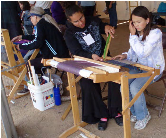
Photos from Estes Park Children's Tent