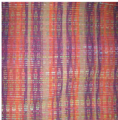
Below: Placemats by Judi Arndt