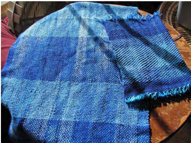
Above and left: Deb Greer's magic blue shawl and placemats on the loom and off.