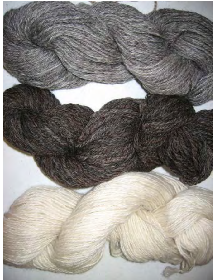
Above: Handspun by Chris Race.

303-442-1884 info@gypsywools.com 1227 Spruce Boulder, CO 80302 Tues. - Sat. 10 - 6 www.gypsywools.com